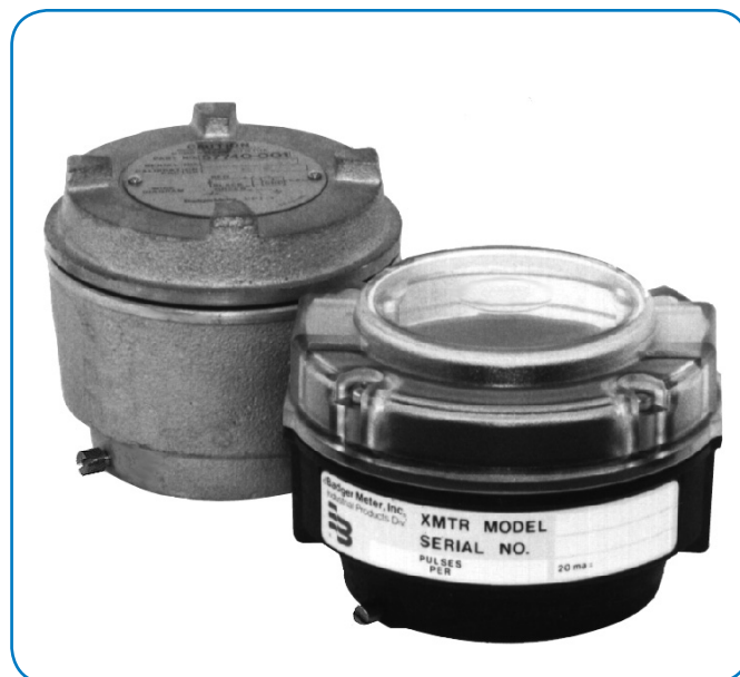
MS-E5XP (rear) and PM5 Transmitters